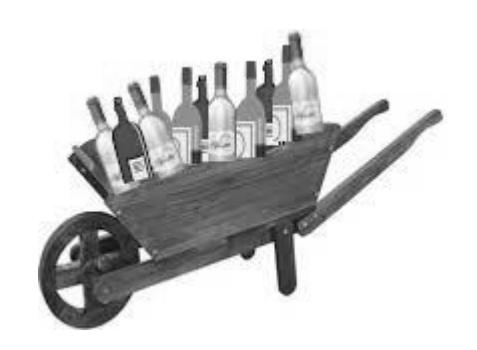
In aid of Wales Air Ambulance Tickets £1 each

Don't miss out on our Prize Draw with the chance to win a BARROW of BOOZE!