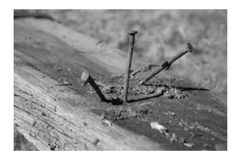
Least number of hits wins!